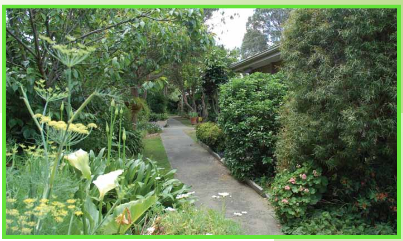
A view of the Heights garden